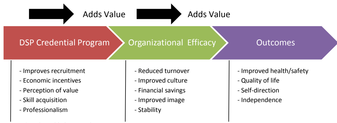
Figure 1. Value added approach

If there is any reason alone to create a DSP credential program in SD, quality outcomes is at the base. While they have always been an element examined by regulators and accreditation organizations – they are the reason for the existence of CSPs. People receiving services come first in this field, and developing a DSP credential program is the foundation for quality outcomes! In many ways, such a program is a value added approach to service delivery. Figure 1 illustrates the concept.