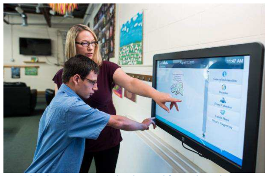
As technology increases, the demand for technical training moves beyond mandating training.

Workforce Solutions Workshop (2015) noted above, also yielded some general information regarding training and staff development challenges. The two major themes regarding training that were generated at the workshop included training pertaining to services provided (i.e. technical skills and methods of delivering service) and a lack of training in organizational culture/dynamics (e.g. leadership, departmental relationships, staff empowerment). In